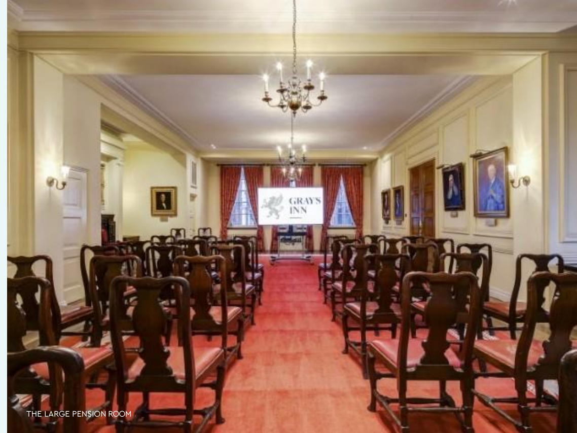
THE LARGE PENSION ROOM

MEETINGS AND CONFERENCE FOR 10 TO 20 GUESTS