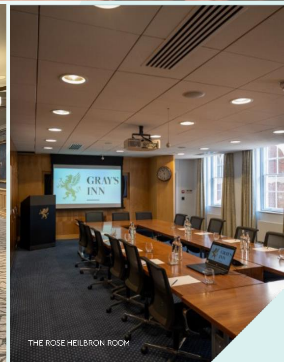
THE ROSE HEILBRON ROOM