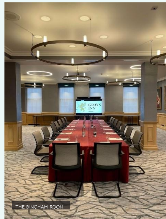
THE BINGHAM ROOM