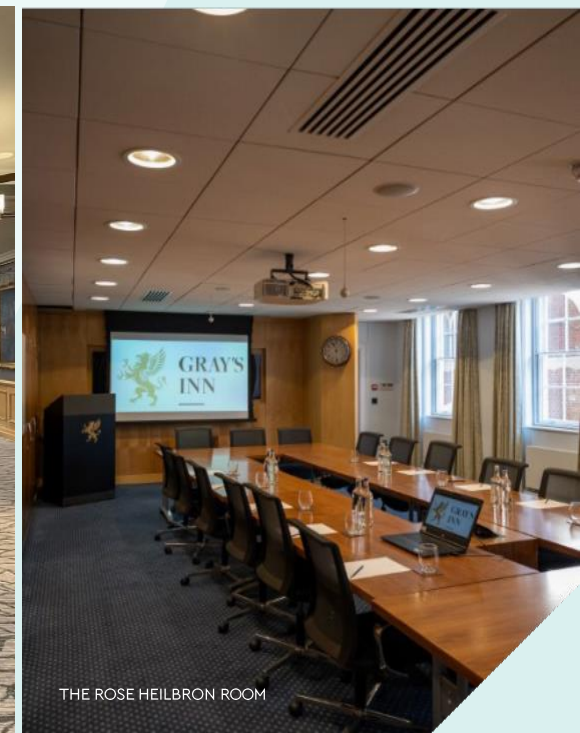
THE ROSE HEILBRON ROOM